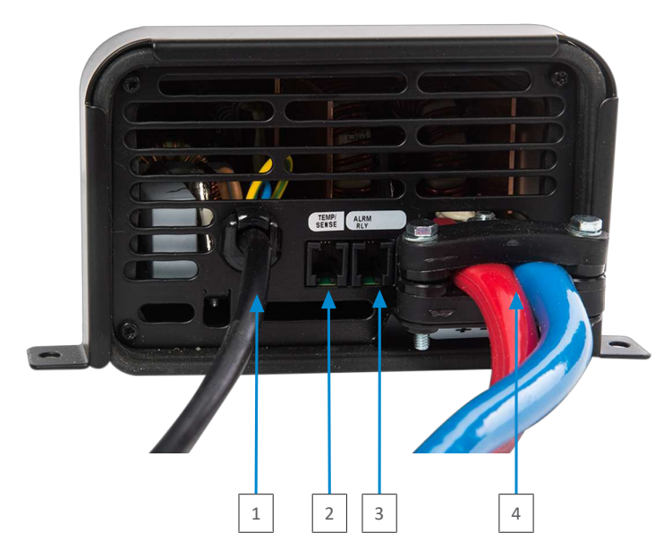
Fig. 2: ABC connection side with connection for CBL and sensor line CTS/TS