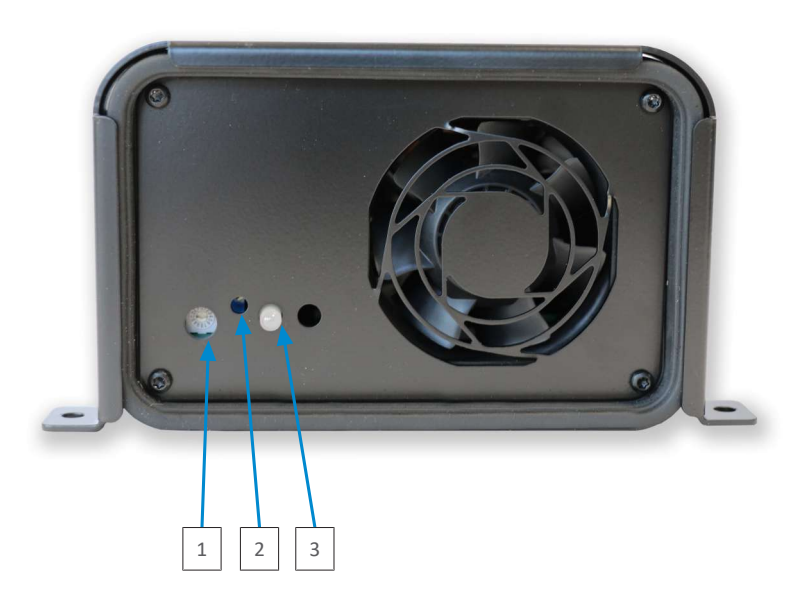
Fig. 1: ABC front view

The ABC charger has been developed for permanent installation in vehicles for charging lead acid batteries. Thanks to their compact design, high performance and excellent radio interference suppression, LEAB chargers have been used for many years wherever optimum battery charging is required.