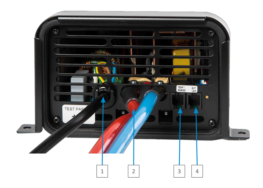
Fig. 3: ABC connection side with connection for sensor line CTS/TS and remote display